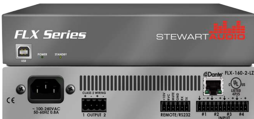
FLX 160-2-CV-D shown

The FLX Platform is the most versatile 1/2 rack networked amplifier Stewart has ever produced. This compact package contains over 300 watts of power output in various channel configurations and impedances. At the heart of the platform is a robust, internal full function DSP that is designed to solve a multitude of your audio problems in just one box. The channel count varies from 1-4 channels and the DSP allows further configuration via routing, EQ, filters, limiters and much more. A USB port makes programing simple, fast and repeatable for large installations. The RVC and RS-232 control allow volume control from a wide range of devices. In addition, the FLX platform has an optional factory installed Dante™ card with 4 channels of networked audio in and out. You won't find a more flexible combination of power output and processing in a comparable package on the market today.