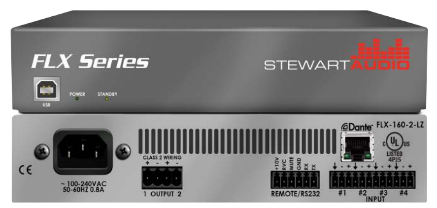
FLX 160-2-CV-D shown

The FLX Platform is the most versatile 1/2 rack networked amplifier Stewart has ever produced. This compact package contains over 300 watts of power output in various channel configurations and impedances. At the heart of the platform is a robust, internal full function DSP that is designed to solve a multitude of your audio problems in just one box. The channel count varies from 1-4 channels and the DSP allows further configuration via routing, EQ, filters, limiters and much more. A USB port makes programing simple, fast and repeatable for large installations. The RVC and RS-232 control allow volume control from a wide range of devices. In addition, the FLX platform has an optional factory installed Dante™ card with 4 channels of networked audio in and out. You won't find a more flexible combination of power output and processing in a comparable package on the market today.